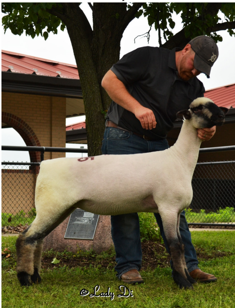
Reserve Junior Champion ewe at the 2015 National Oxford Sale

Born: 9-26-15 TW Sire: EVFO 316 QRNNP 297999 Dam: EVFO 278 QRNNP 296490 Fancy, Fancy, Fancy! Out of one of our favorite "Sumo" daughters and will be Futurity nominated.