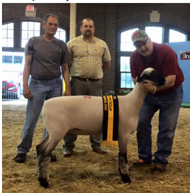
Champion Ewe at the 2015 Illinois Shropshire Spectacular Sale

Born: 3-23-15 TW Sire: Rueber Shrops 1224 RRNN M448123 Dam: Rueber Shrops 1247 RRNN M448121 A young yearling ewe with a lot of growth potential left. Flashy style & good breed character. Check her out to complete your show flock.