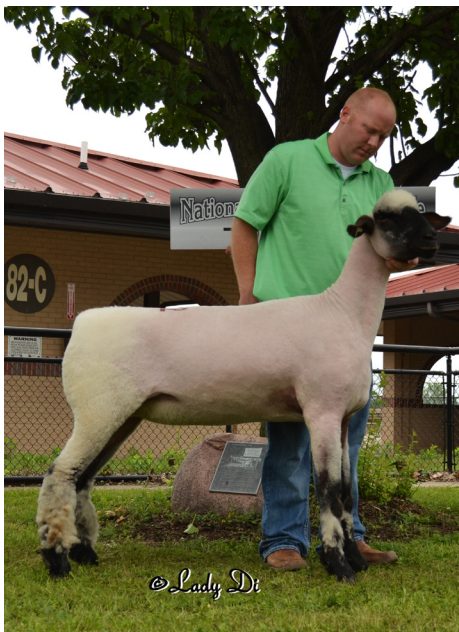
Reserve Senior Champion ewe at the 2015 National Oxford Sale

I've saved the best for last. 0031 is one of our later ewes born but man is she the ewe that stands out. Big bodied, massive rack, thick twist all tucked into a neatly assembled shoulder & hip. No doubt you need to show this one as a slick and let her muscle do the talking. Watch her walk away, her skeleton is right, all landing on that sasquatch bone.