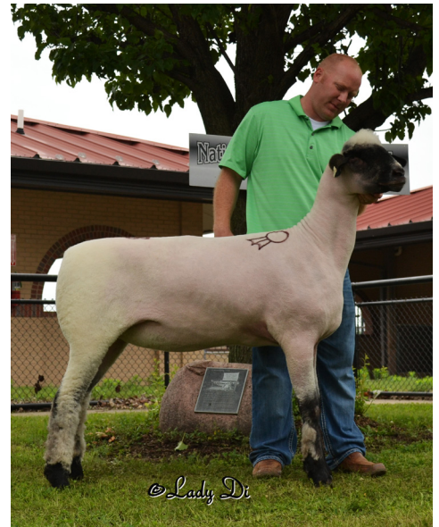
Champion Ewe consigned by Double O Acres at the 2015 National Oxford Show & Sale