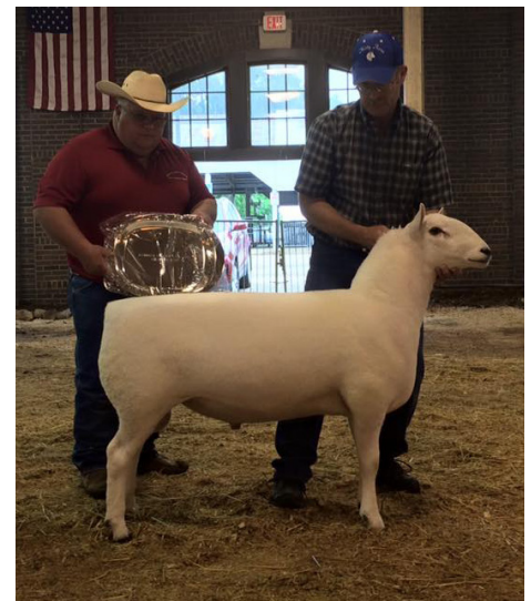
Champion Ram was consigned by Misty Acres at the 2015 National Cheviot Sale

Born: 3-15-16 S Sire: Moenter Homestead 15MM15 8766U Dam: Shoops Fashion Lane 15-15 15118J Great breed character