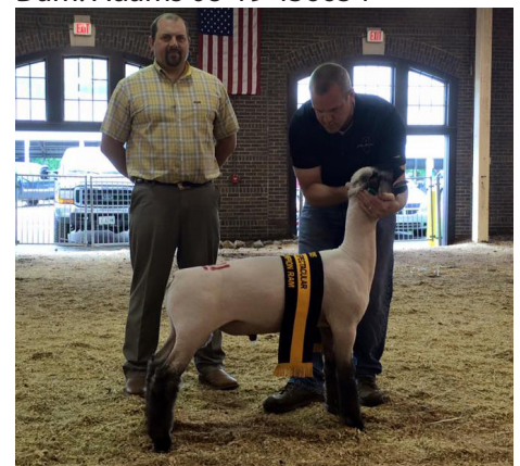
Champion Ram at the 2015 Illinois Shropshire Spectacular Sale

Born: 2-17-16 Sire: Adams 1313 "Spooky" 449504 Dam: Adams 08-19 436654