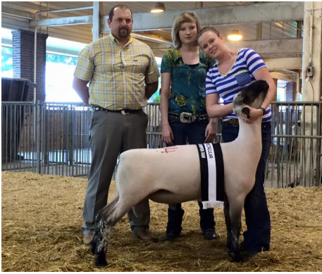
Reserve Champion ram at the 2015 Illinois Shropshire Spectacular Sale